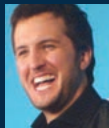
LUKE BRYAN COUNTRY MUSIC ARTIST