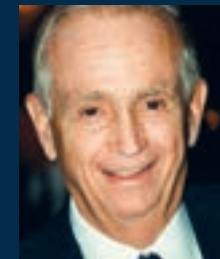
BILL MARRIOTT CHAIRMAN, MARRIOTT INTERNATIONAL