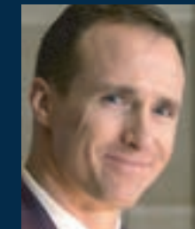
DREW BREES SUPER BOWL WINNING QUARTERBACK, NFL'S NEW ORLEANS SAINTS