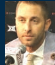
KLIFF KINGSBURY HEAD COACH, NFL'S ARIZONA CARDINALS