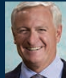
JIM HASLAM OWNER, NFL'S CLEVELAND BROWNS