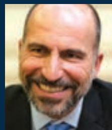
DARA KHOSROWSHAHI CEO, UBER