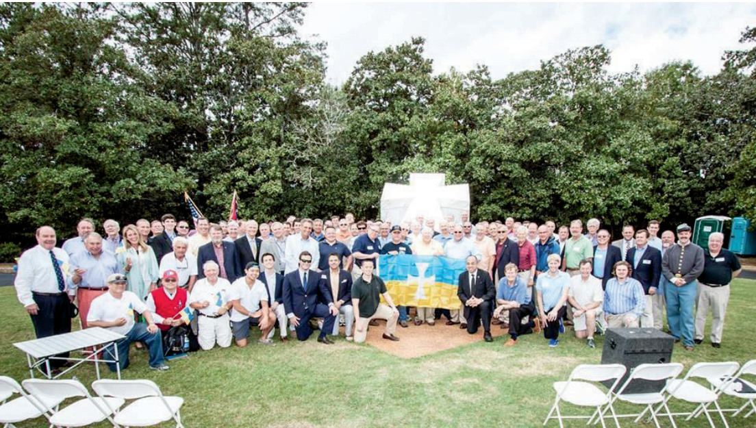
CONSTANTINE CHAPTER MEMORIAL 150TH GATHERING