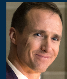
Drew Brees Super Bowl winning quarterback New Orleans Saints