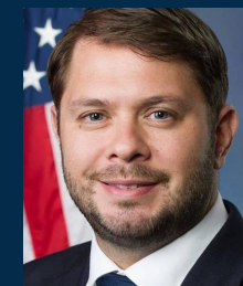
Ruben Gallego US Congressman