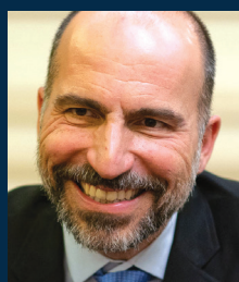
Dara Khosrowshahi CEO, Uber