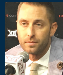
Kliff Kingsbury Head Coach, NFL's Arizona Cardinals