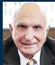
Ken Langone Co-Founder, The Home Depot