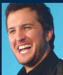
Luke Bryan Country Music Artist