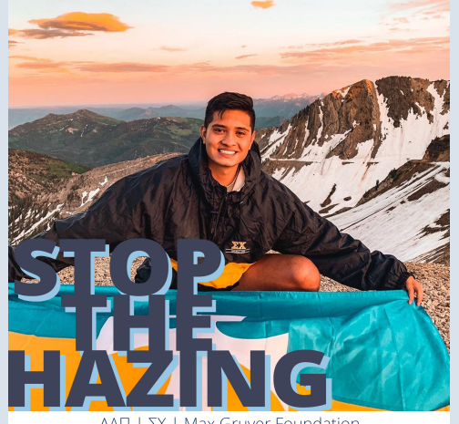
AΔΠ | ΣX | Max Gruver Foundation