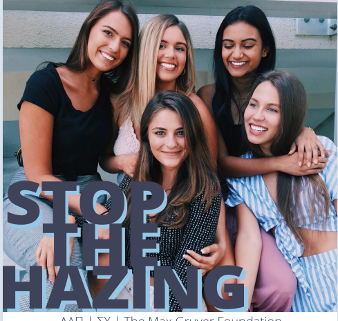
AΔΠ | ΣX | The Max Gruver Foundation

We encourage everyone to update their Facebook profile picture to promote the #StoptheHazing #FlyHighMax campaign now through September 27th for National Hazing Prevention Week.